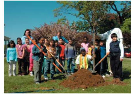
Students from School #3 help grow the Take Pride program in Clifton by planting trees on Earth Day.