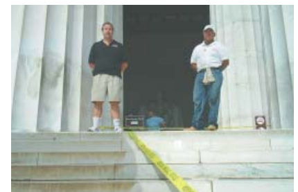
Volunteer powerwashers show the difference their work makes at the Lincoln Memorial.

identifying environmentally compliant cleaning materials and methods, meeting strict security standards, securing access to water for the machines, and achieving safety standards for the