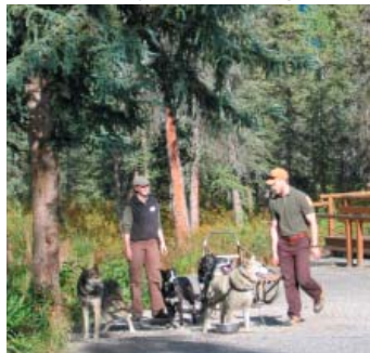
SCA volunteers led a dog sled demonstration for park visitors at Denali National Park.