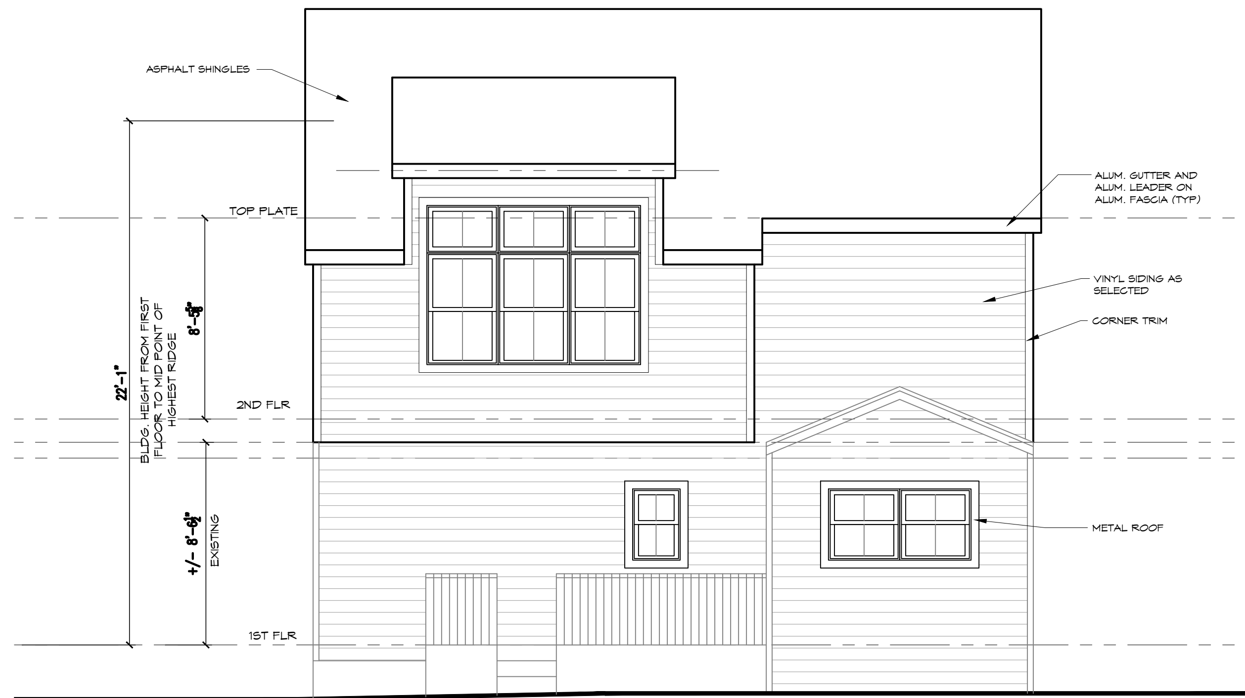
3 REAR ELEVATION 1/4" = 1'-0"