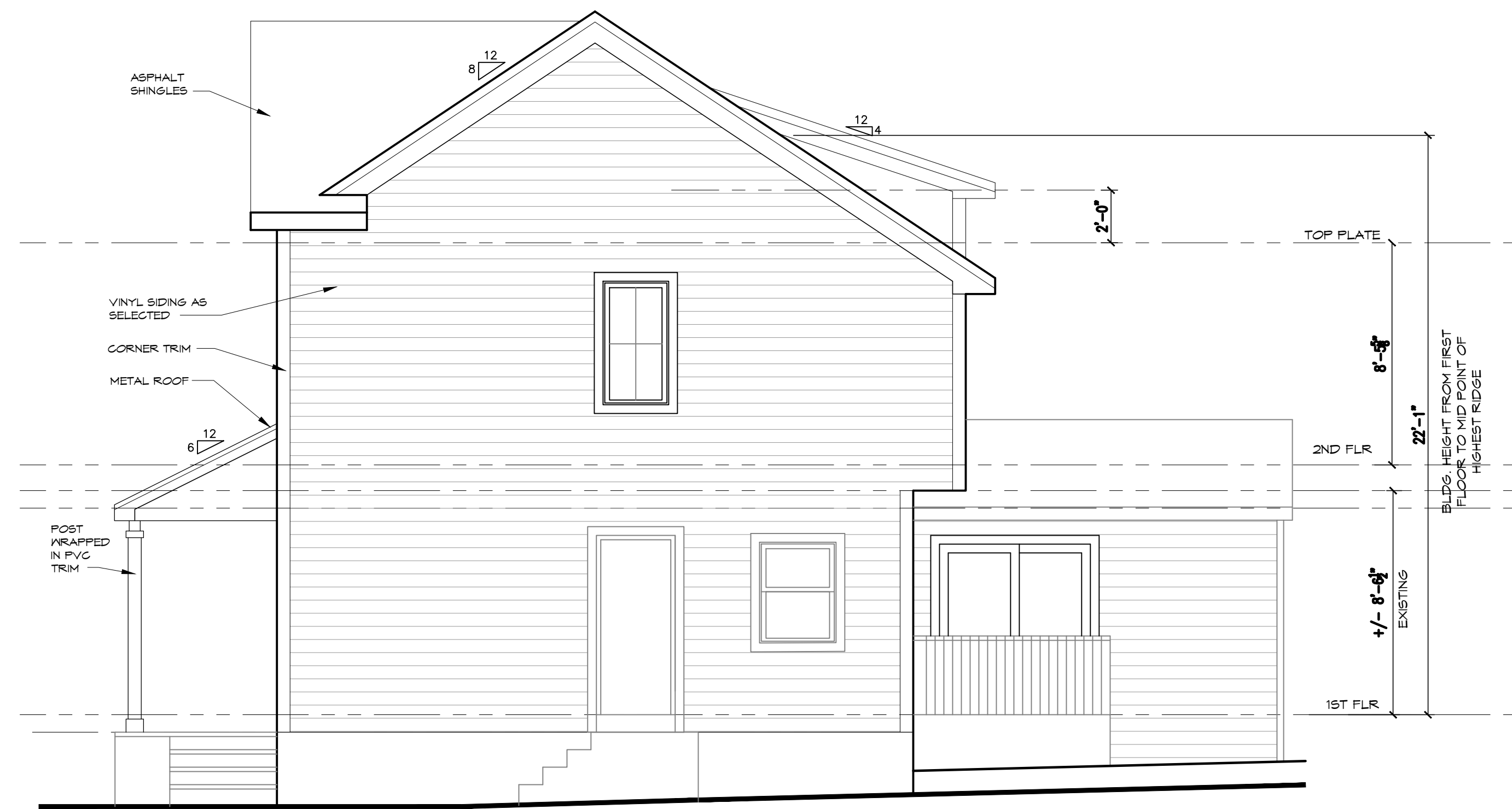
2 RIGHT ELEVATION 1/4" = 1'-0"