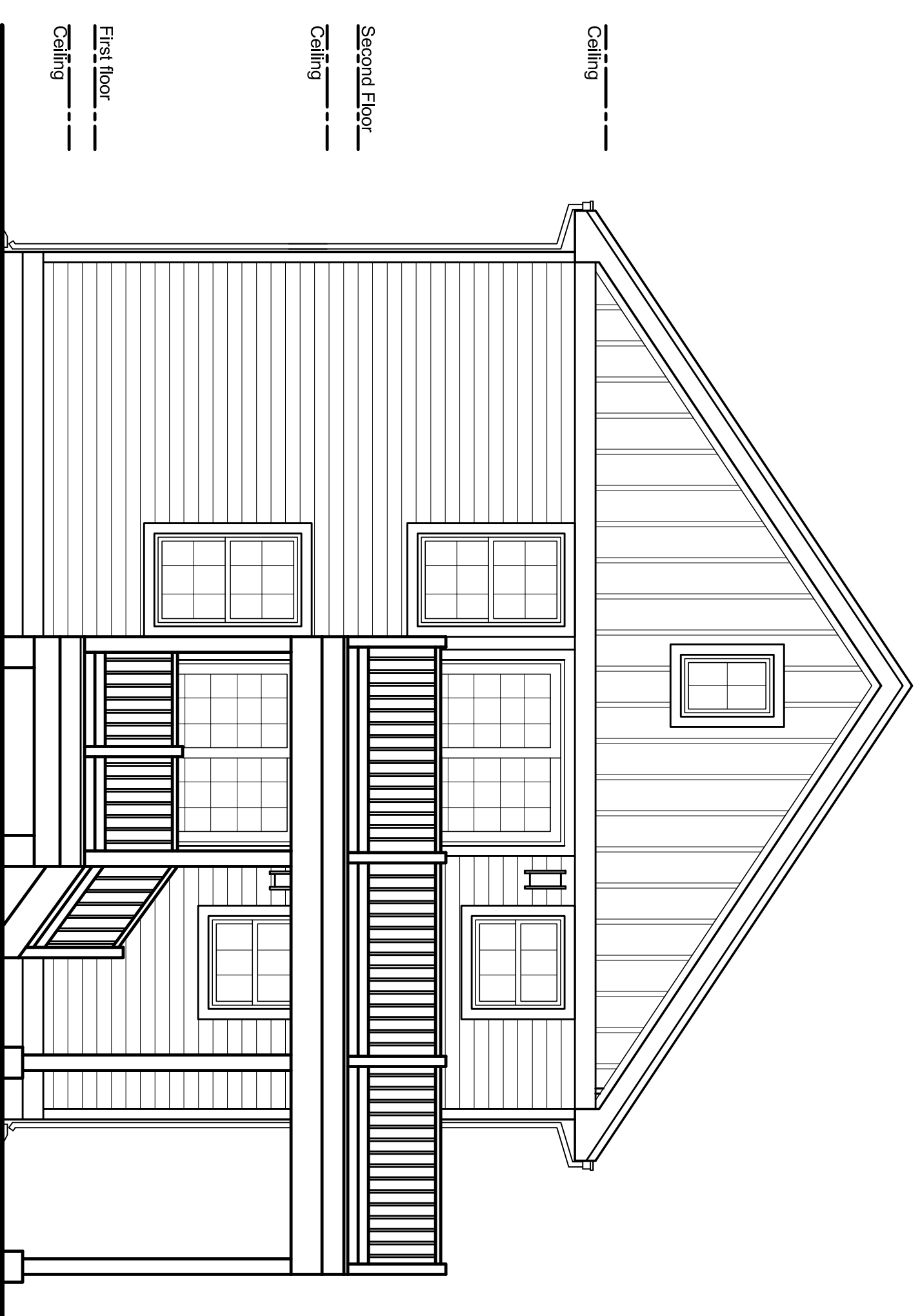
Rear Elevation Scale: 1/4" = 1'-0"